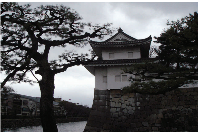
Photo by Elise Gee. You can find her wonderful photos at: http://www.flickr.com/photos/tangerine222/