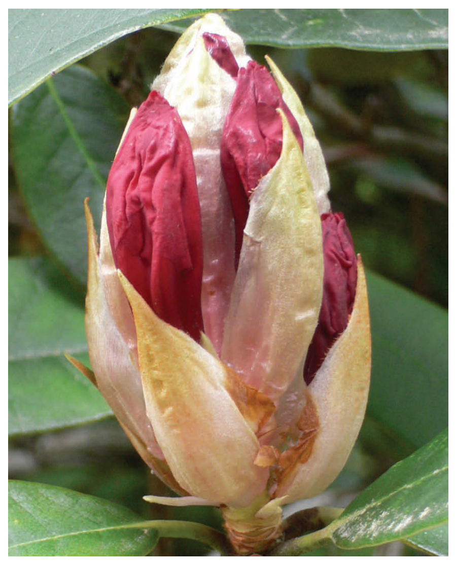
Continued on Page 10