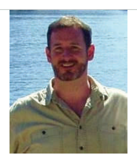
All Hypnosis is Self Hypnosis

When talking about hypnosis, the idea of free will is everpresent. The exact words "free" and "will" may not be spoken aloud, but the concept pervades every crevice of the dialogue. You can see it happen when you mention hypnosis in conversation. A quick flicker will pass across the face of your conversational partner. Eyes cloud over just a little, and the corners of mouths tighten. The weight of things left unsaid hangs in the air.