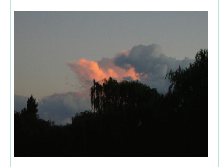
Diane Auld ©2010